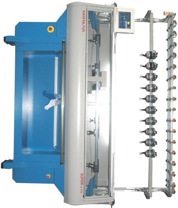
Super-J 212 SC

With the incorporation of the 3-way sinker system device, our Super-J has the ability to perform a wide variety of shoe cover pattern designs. In addition, our segment type take-down device is individually adjustable which results in the capability for the production to adapt to various needs.